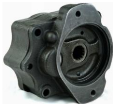
7S 4629 OIL PUMP 950 C