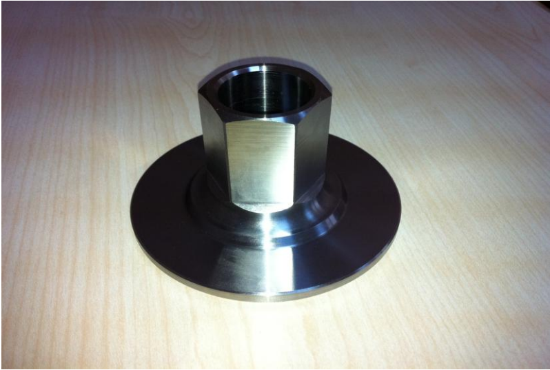
FLANCHE 1 ¼ UNC