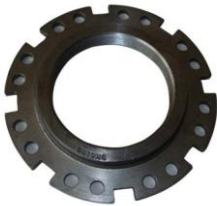
9K 6198 NUT 966 C