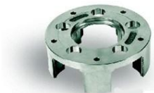
346 350 3208 CARRIER MERCEDES