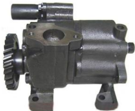
6128-52-1013 OIL PUMPS D155