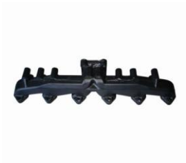
6221-11-5120 EXHAUST MANIFOLD WA-320