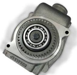
2W 8002 WATER PUMP 3304 3306