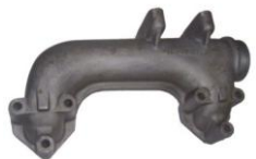
6127-11-5132 EXHAUST MANIFOLD FRONT D155