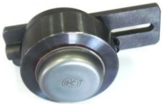
BC673-5884 TENSIONER BOBCAT 673, 743