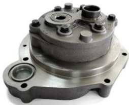
7G 4856 OIL PUMP 950 B