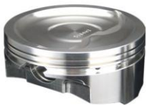
1A091-2111-2 STD PISTON KUBOTA V1903,V2203 BOBCAT 643, 743