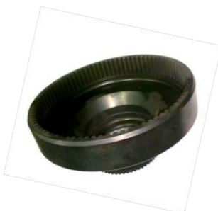
1269 332 020 PLANET GEAR