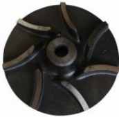
6138-61-1330 WATER PUMP IMPELLER WA 420