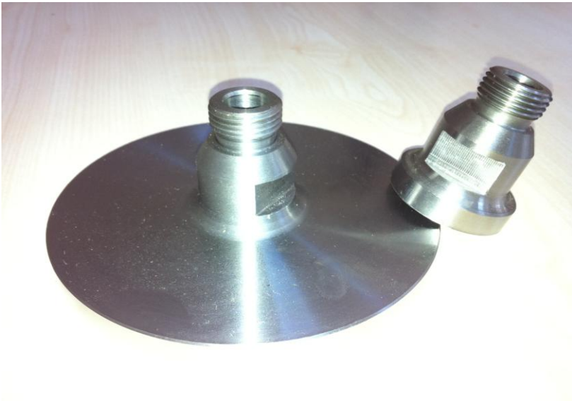
FLANCHE R ½ BSP