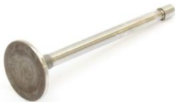
1684-13110 VALVE INLET KUBOTA V1903,V2203 BOBCAT 643, 743