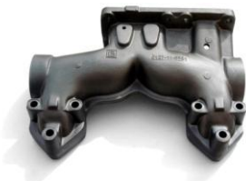
6127-11-5331 EXHAUST MANIFOLD CENTRE D155