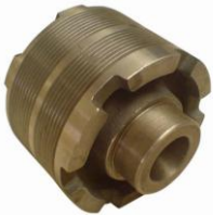
6221-33-1411 PULLEY LODER