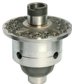
346 350 0427 / 81.35100.6085 DIFFERENTIAL CASE