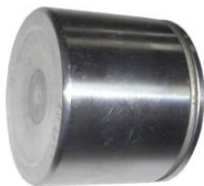
4V 4852 PISTON 950 B, 936