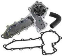
15521-730035 WATERPUMP KUBOTA V1903,V2203 BOBCAT 643, 743