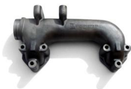
6127-11-5113 EXHAUST MANIFOLD REAR D155